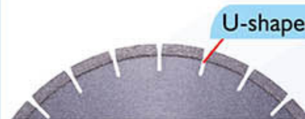
Fig. 3_b: Segmented rim