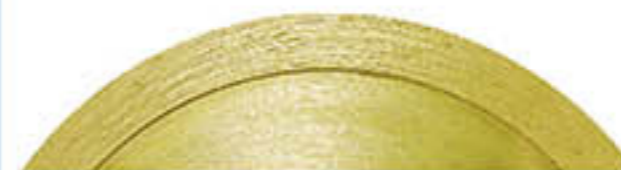
Fig. 1: Continuous rim