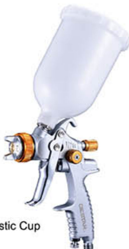
POM Plastic Cup