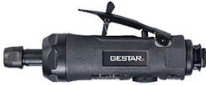
Aluminium body with plastic cover