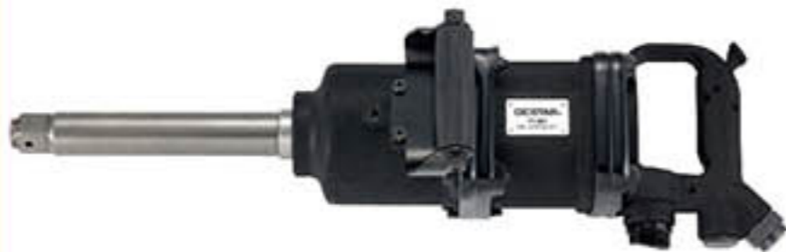
Pin Less Side Exhaust

Square Drive : 1" Anvil : (771-836) 6-1/2" (771-838) 8" Torque Range : 1,000 ft-lb (1,400 Nt-m) Max. Torque : 1,500 ft-lb (2,000 Nt-m) Free Speed : 4,000 RPM Air Consumption : 15 Cfm Air Inlet Thread : 3/8" PT Noise Level : 102 dB Vibration : 13.93 m/s 2