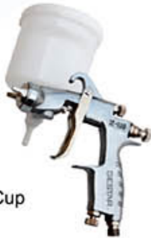
POM Plastic Cup